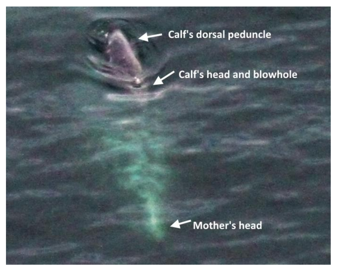
Figure 1. Gray whale calf at the water surface back-riding the rear left peduncle area of its mother as she swims below the water surface (mother has lighter body color) on 15 February 2011. Apparent nursing also was observed as the mother rested at the surface.