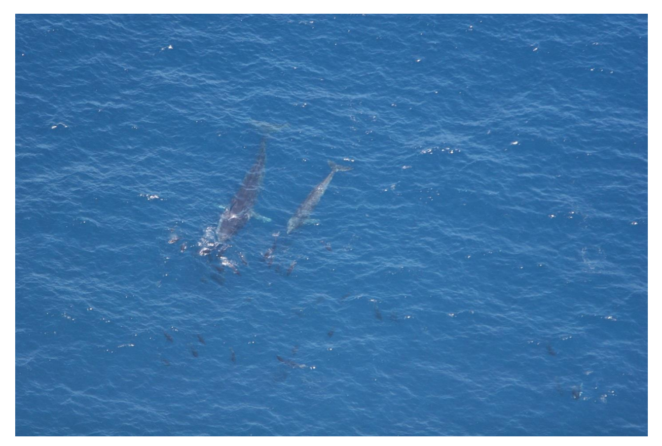
Figure 3. Same fin whale mother-calf pair as depicted in Figure 2, following and interacting with northern right whale dolphins on 6 June 2009. Photograph by Lori Mazucca, NMFS permit 14451.

Figure 2 . Apparent nursing by a fin whale calf (on upper left with white-colored ventral area visible below surface and head oriented toward the mother's teat area; mother's body is dark-colored to right) on 6 June 2009. Photograph by Lori Mazucca, NMFS permit 14451.